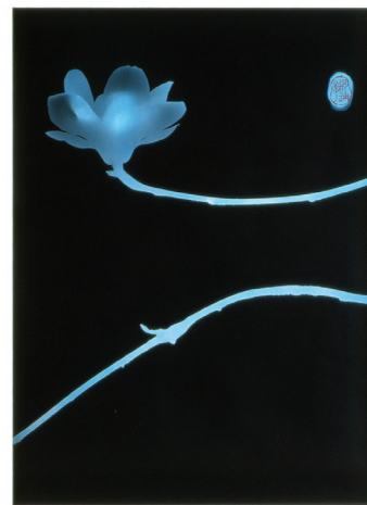
SUSAN PURDY NEW BRANCHES ON AN OLD TREE