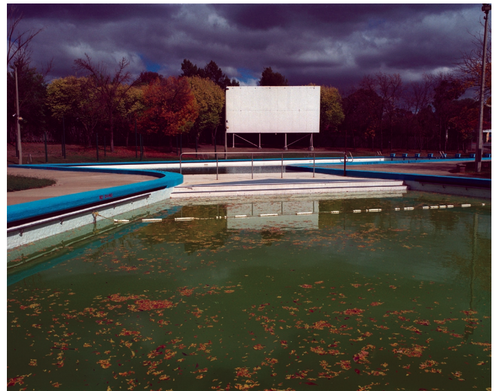
MARCIA LOCHHEAD MIRROR

"Melbourne Art Fair 2004", The Art Newspaper , vol. XIV, no. 151, October 2004: 3,4