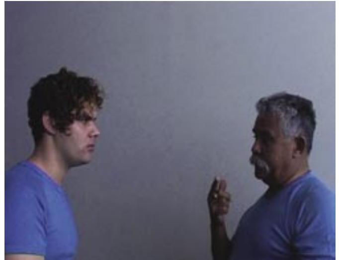
Christian Thompson Father You Know I'm Not So Free 2006, DVD, sound, 2:30mins (video still)

61 in magazines and art journals, 20 in local/street press and organisational newsletters, 35 in electronic media, 16 on radio and 2 on television.