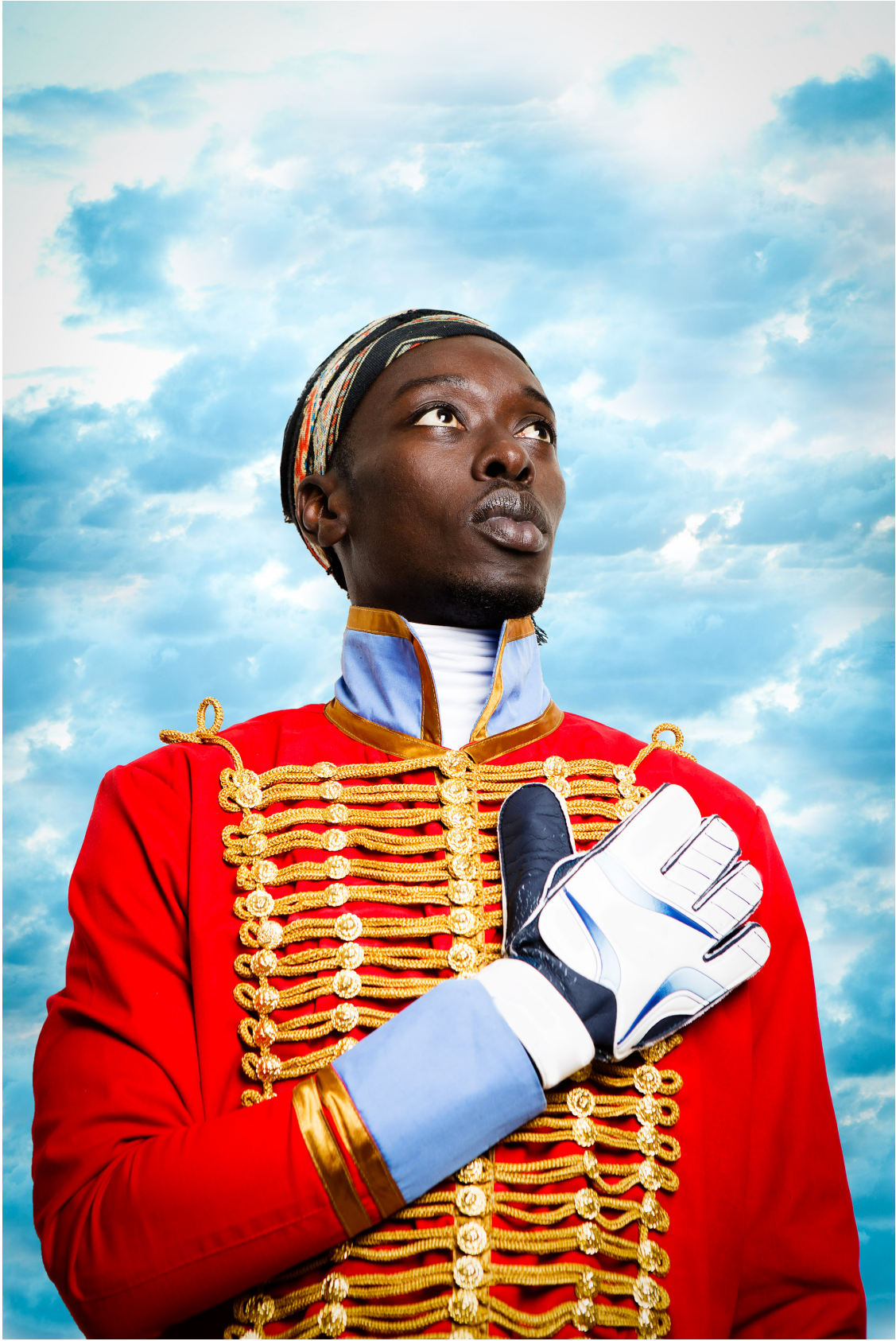
Omar Victor Diop, 'Pedro Camejo', 2015 from the series 'Project Diaspora'