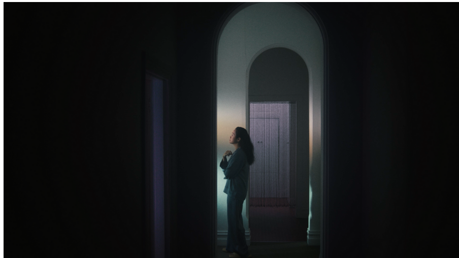
Nikki Lam, 'Reprise', 2022